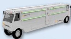
EMERGENCY VEHICLE ELECTRIC